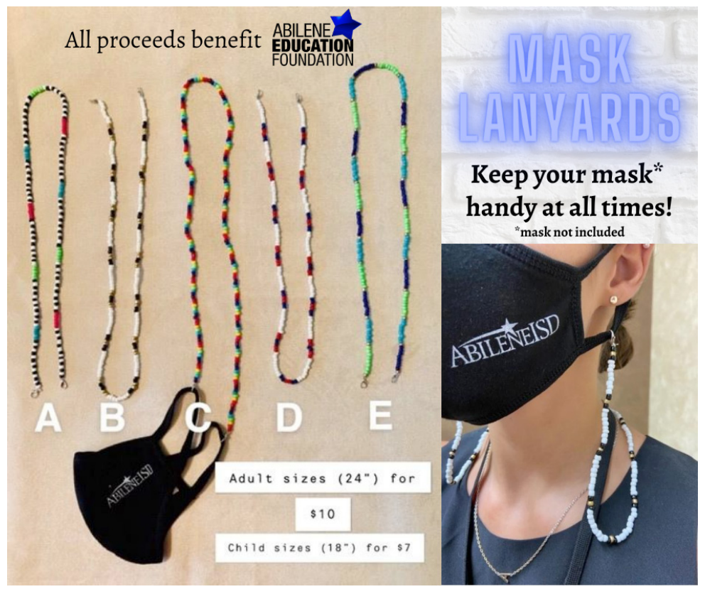
COOL mask lanyard fundraiser. Still available too!