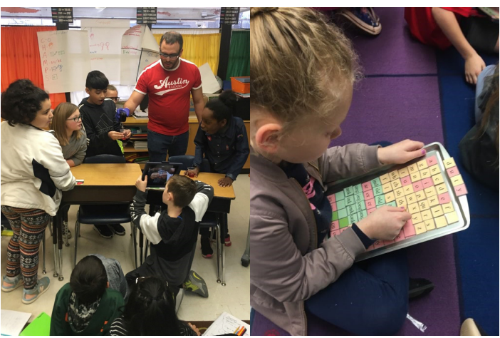
A couple STAR Grants in action: Science Lab experimets(left) and Fundations(right) a phonetic reading supplemental program. (Pictures from 2019)

In the fall of 2019, the Abilene Education Foundation awarded 106 grants totaling $75,750 to 122 different