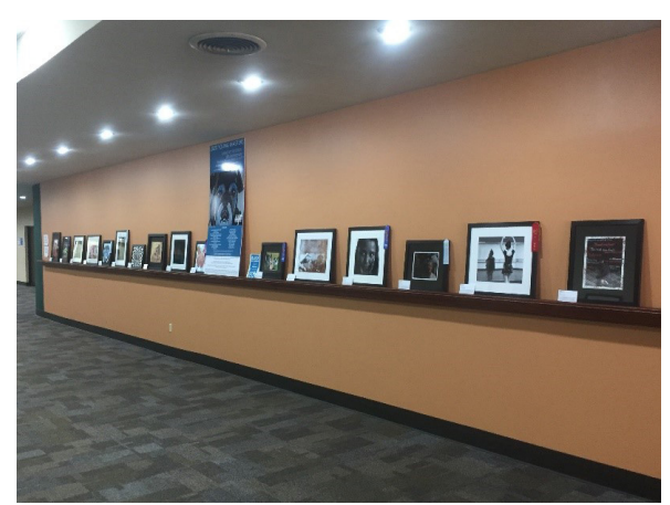
Exhibit displayed at One AISD Center.

the Hearts for the Arts program of the Abilene Cultural Affairs Council and the City of Abilene, and the Abilene ISD Fine Arts Department. For many artists, it's their first opportunity to be recognized by the public and to share their works with a broader audience. Each artist is also given a printed catalog and flash drive showcasing their work, providing tangible examples for the artist's portfolio. Such experience is invaluable as students continue with their artistic passion and seek acceptance into prestigious art programs for higher education.